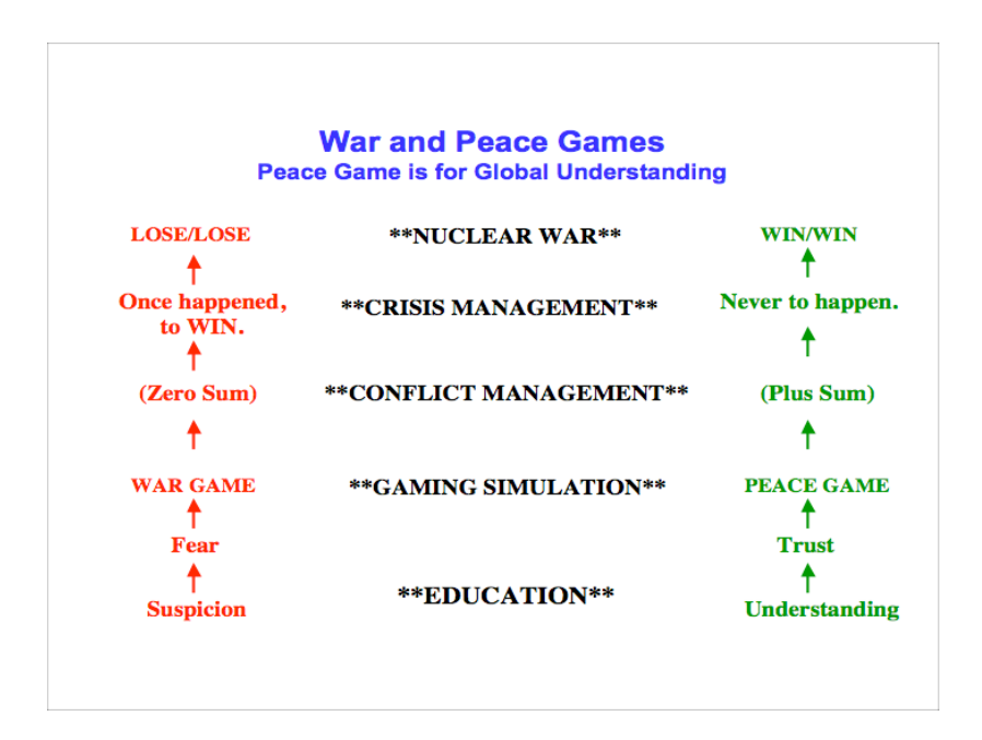
Fig. 1.2: Comparison of War and Peace Games <War and Peace Games-no background-1 copy.pdf> <a href="http://tinyurl.com/cqb8xq">http://tinyurl.com/cqb8xq</a>

(*) which term I coined more than 35 years ago. War gaming is to win the war once when it happened, and peace gaming is to avoid the occurrence of war (Fig. 1.2). Avoiding war is much cheaper than waging war.